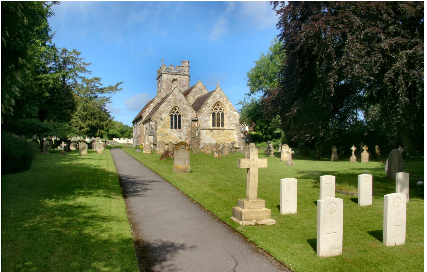
St George's Churchyard, Fovant – War Graves at front & rear